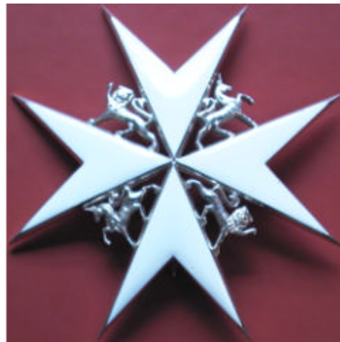
Illustrations II and III.

Illustration II shows the design of the Star worn by Bailiffs and Dames Grand Cross ( 3\frac{5}{8} inches) and Knights and Dames of Justice (3 inches).