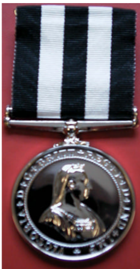
Illustration of the SERVICE MEDAL and its riband

Service which prior to the Appointed Day was not Qualifying Service shall be capable of being Qualifying Service if it satisfies the foregoing provisions of this Appendix (including, for the avoidance of doubt, the provisions for the service to be recorded and certified).