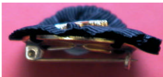
Illustrations IV and V